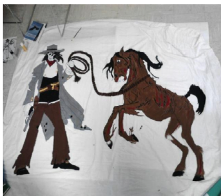
CSC Ag Club's decorated bedsheet for the Homecoming celebration. The theme was

This week (October 22-27) we are taking in the Homecoming festivities. We decorated a bed sheet with this year's theme and look forward to having a float in the parade.